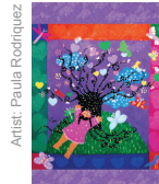
Artist: Paula Rodriguez

Long ago, guided by a bright star, kings brought extravagant gifts to an infant born in a cow stall. Today, we bring 'simple gifts' to a troubled world, seeking hope for peace in a new day.