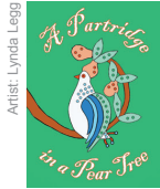
Artist: Lynda Legg